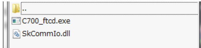
Figure 2. C700_ftcd.exe and SkCommIo.dll in folder