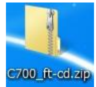
Figure 1. C700_ft-cd.zip

b.) Turn on your computer and start Windows. After unzipping downloaded file from website, there are “C700_ftcd.exe” file and “SkCommIo.dll” file in the folder.